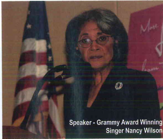
Speaker - Grammy Award Winning Singer Nancy Wilson

The featured speakers are a true manifestation of Girls Inc's mission to "inspire all girls to be strong, smart, and bold."